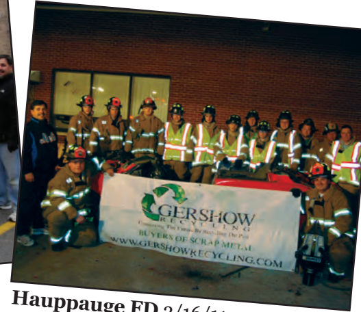
Hauppauge FD 3/16/11