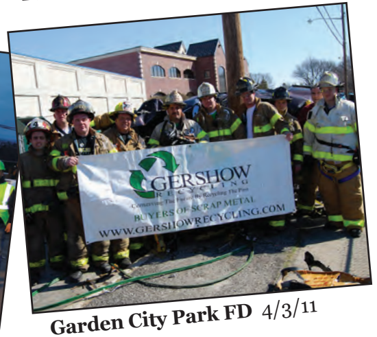
Garden City Park FD 4/3/11