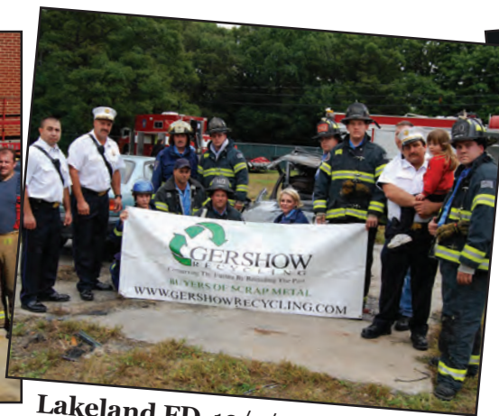
Lakeland FD 10/3/10