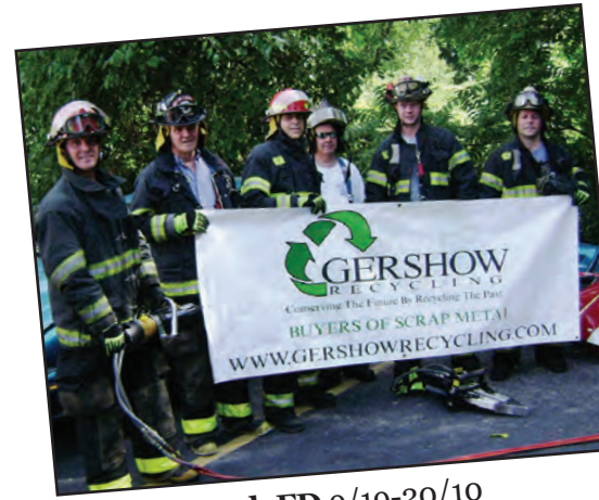
Eaton's Neck FD 9/19-20/10