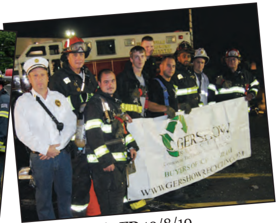
Farmingville FD 10/8/10