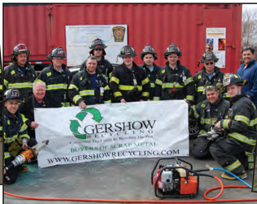
Holbrook FD 4/10/11