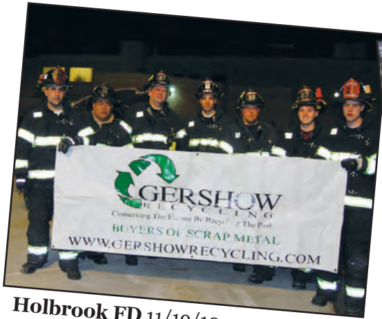
Holbrook FD 11/19/10