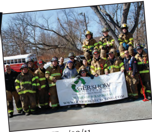
Sayville FD 3/20/11