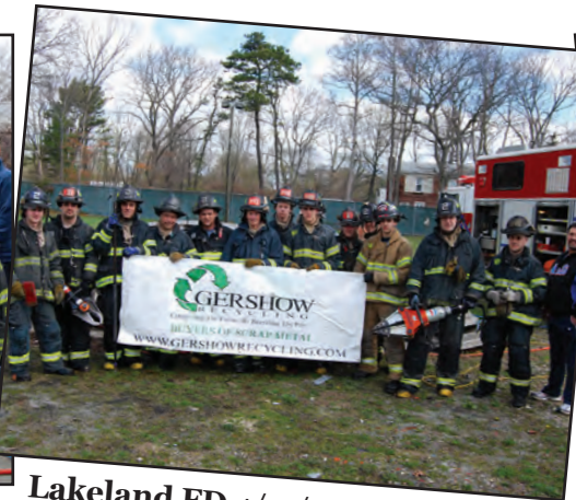
Lakeland FD 4/17/11