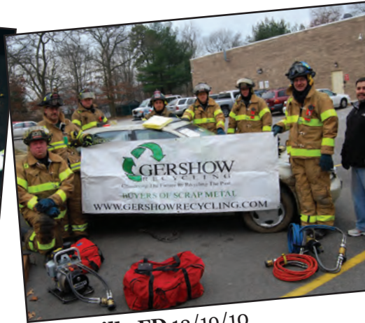
Sayville FD 12/19/10