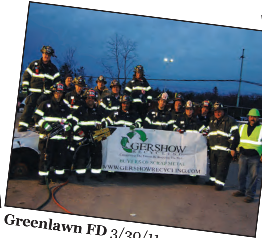
Greenlawn FD 3/30/11