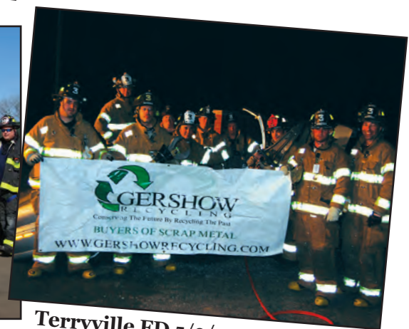
Terryville FD 5/3/11