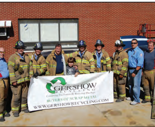
Hauppauge FD 10/2/10