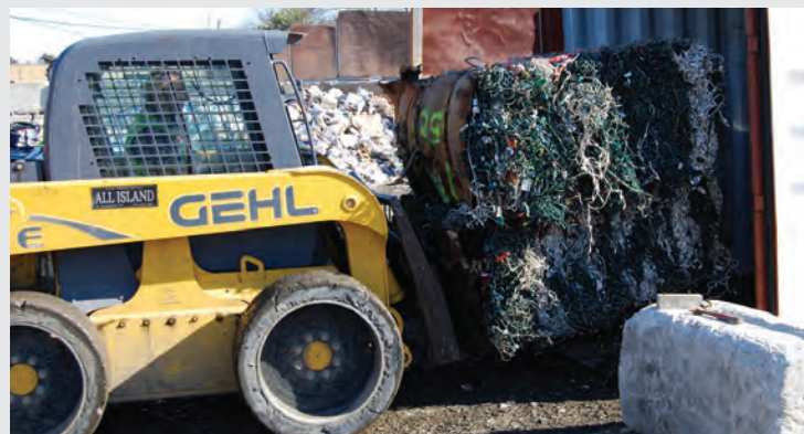
Following the holidays, Gershow recycled and exported 50,000 lbs. of holiday lights. Pictured above is a forklift loading a container for export at Gershow's Medford facility.