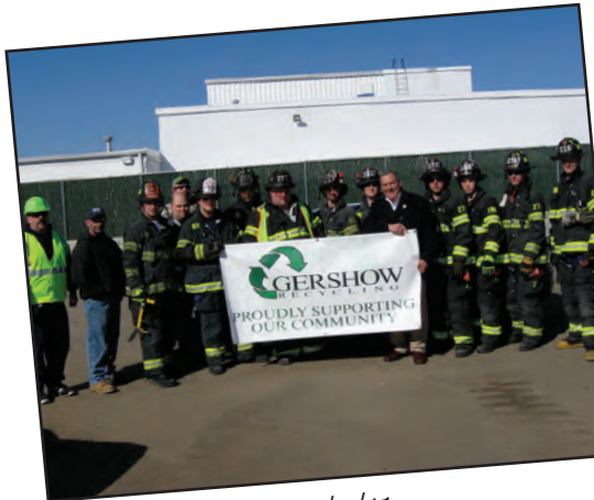
Huntington FD 4/3/11