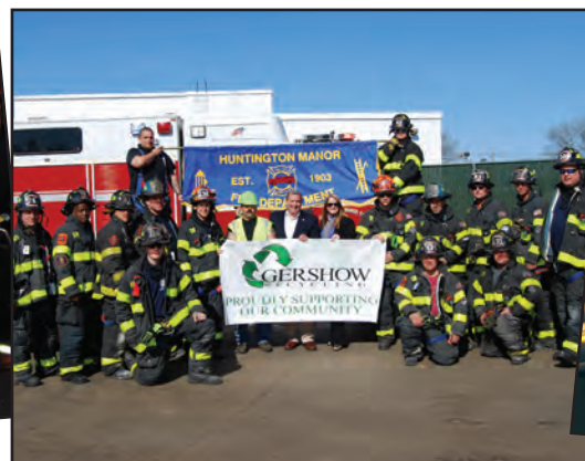
Huntington Manor FD 5/1/11