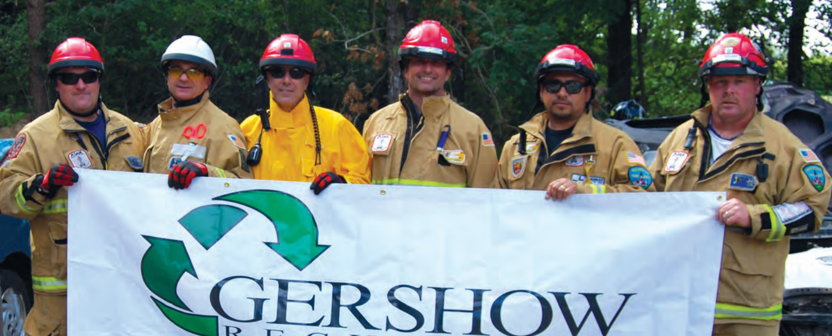
Members of the Montauk Fire Department at the 2013 North American Vehicle Rescue Challenge, in front of two of the 25 vehicles provided by Gershow